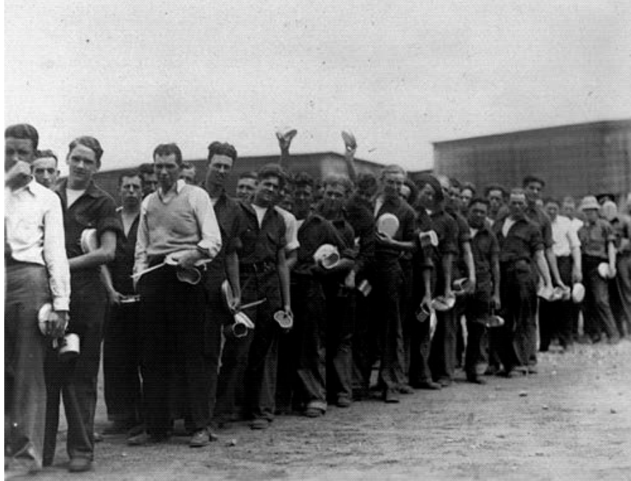
Civilian Conservation Corps