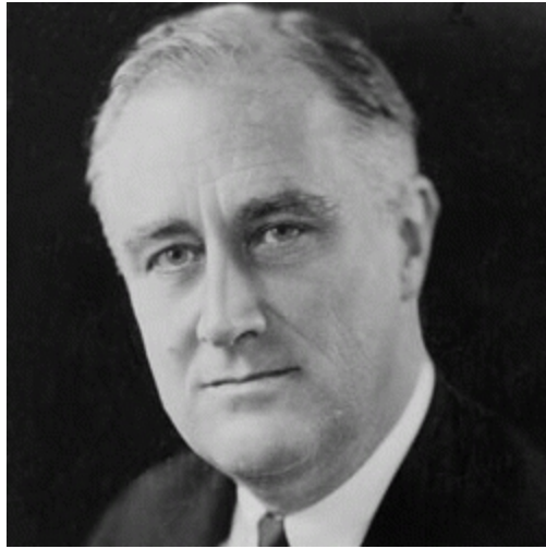
Franklin Delano Roosevelt