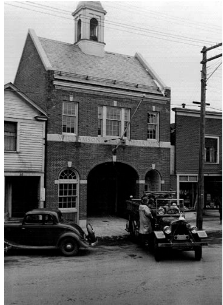
Public Works Administration